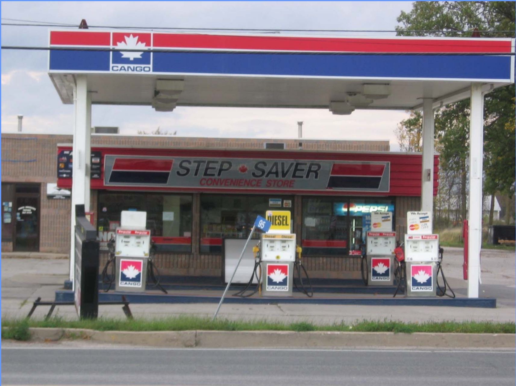
Source: Canadian Lifestyle and Fitness Research Institute