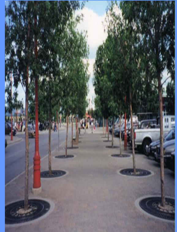
Pedestrian pathway in a big box parking lot

It can happen in both urban and rural areas. It just looks different.